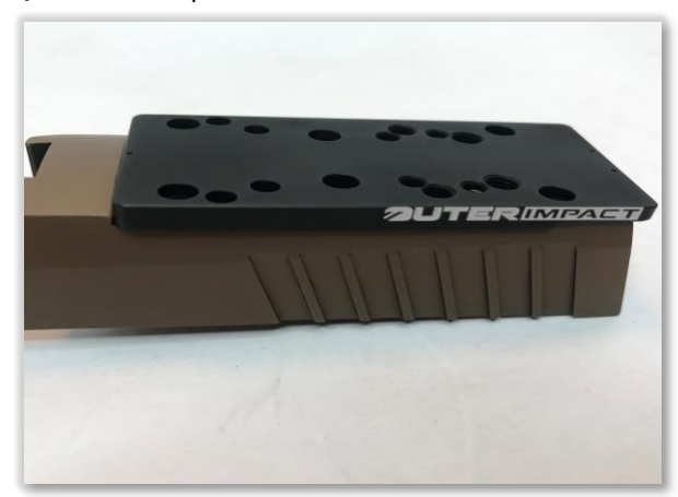
Step 4: Reassemble slide per manufacturer instructions.

Step 3: Secure adapter plate to slide using the 4-48 screws from the bag marked MNT HDWR and torque to 15 in/lb with a torque wrench.